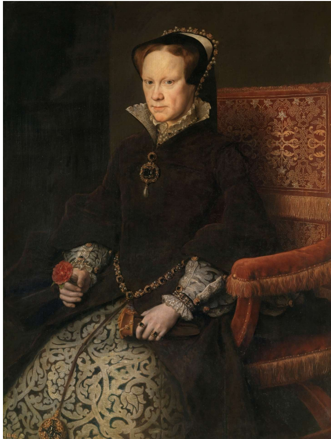
Mary I of England, aka “Bloody Mary”