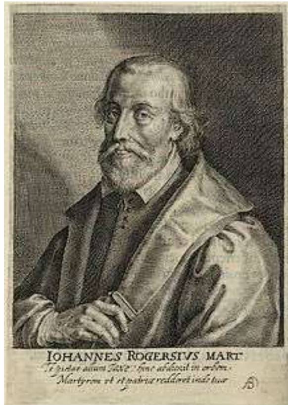
John Rogers (1500-1555)