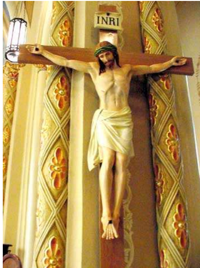
Roman Catholic Crucifix